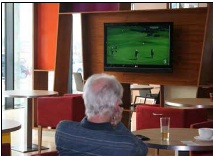
Not everyone was interested in the bridge...