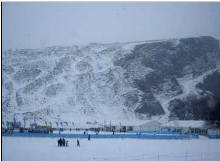
Edinburgh in January was a bit snowy!