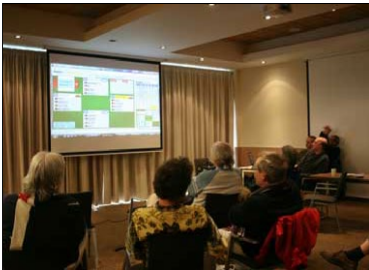
Les Steel cast a critical eye over some of the early play in his winter shirt